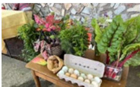
KIDS' FARMERS' MARKET AT UKIAH