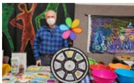
BILINGUAL OUTREACH AT FORT BRAGG