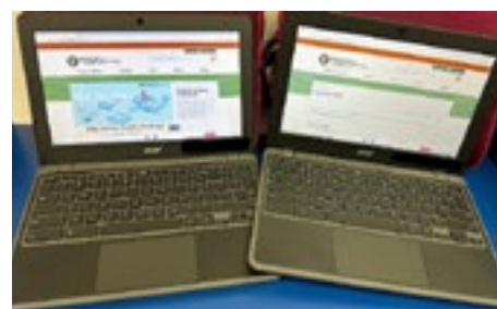
CHROMEBOOKS FOR CHECK OUT